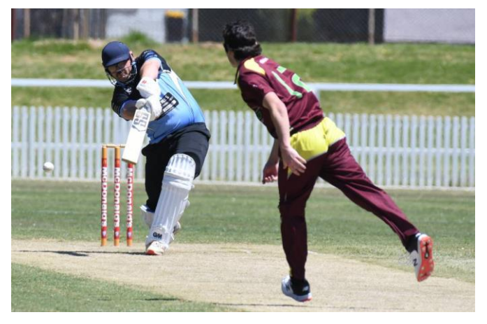
Bathurst City 7/239 (M Day 71* J Coughlan 71 T Lynch 46 H Le Lievre 3/21) def CYMS 8/224 (M Webster 85 M Delaney 36 D Neil 35) by 15 runs at Morse Park 2

Cavaliers 1/168 (H Middleton 80* M Corben 72*) def City Colts 167 (H Shoemark 96 K Buckley 4/31 M Black 3/29 G Cumming 2/37) by 9 wickets at Wade Park