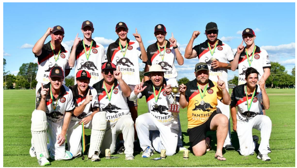
WINNERS: At least half a dozen players from Oberon's second-grade premiership side will compete in the BOIDC this summer.

It's been three years since Oberon fielded a squad in the region's top-flight cricket competition, but the Tigers are set to return to the Bathurst Orange Inter District title race this summer.