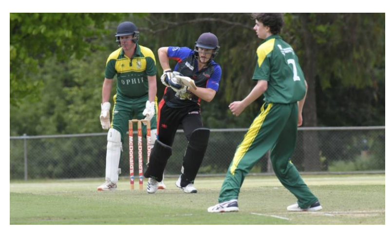
Orange City 2/282 (S Grenfell 138* S Churchill 103*) def Centennials Bulls 92 (K Aubin 26 B Johnson 4/9 B Causer 2/9 A Rutledge 2/29) by 190 runs at Wade Park