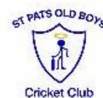
St Pat's Old Boys