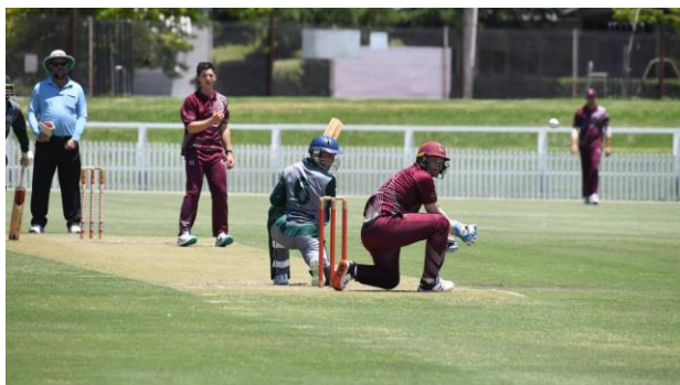
Orange City v Cavaliers

Cavaliers 4/240 (M Corben 88 J Warrington 61 B Ferguson 26 B Causer 2/43) def Orange City 3/237 (S Grenfell 69* B Causer 55* J Goldston-Morris 45 D Burchmore 41) by 6 wickets at Wade Park